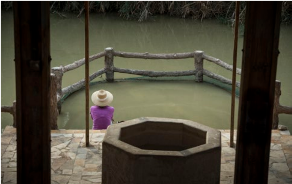
A pilgrim prays on the Jordan River bank.

In New Testament times, Jordan was home to the last of the prophets — John the