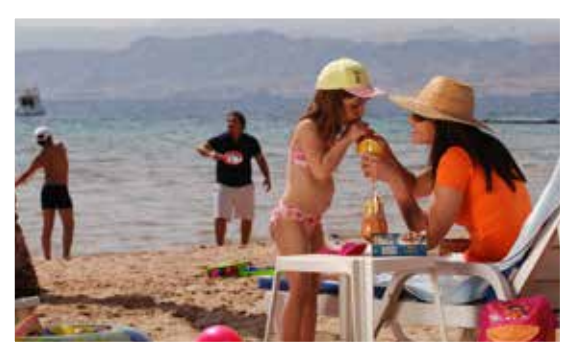
\uparrow The clean and safe beaches of Aqaba.