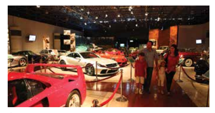
↑ The Royal Automobile Museum.