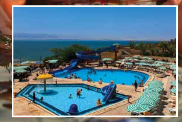
↑ Poolside at one of the Dead Sea hotels. Floating in the Dead Sea. →

↑ Enjoying the purifying qualities of the Dead Sea mud.