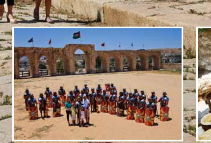
↑ The Roman Army Chariot Experience at Jerash. ← The colonnaded street at Jerash.