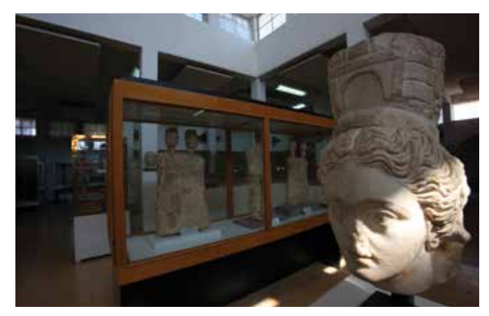
↑ The Jordan Archaeological Museum.

This gallery hosts a superb collection of paintings, sculptures, photographs, installations, and ceramics by contemporary Jordanian and international artists. It aims to encourage cultural diversity and promote art from the Islamic and developing world.