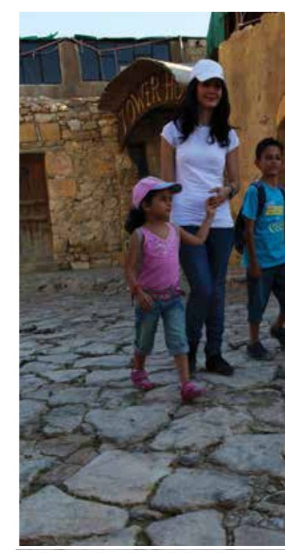
↑ A family stroll at Dana Village.

Where the mountains meet the desert to the west, the award winning 26-room Feynan Ecolodge is a beacon for sustainability with solar power and a host of green practices. Secluded in nature, the tranquil lodge is ideal for