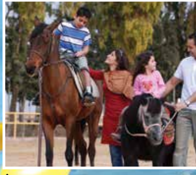
Horseback riding at one of Jordan's many horse clubs.