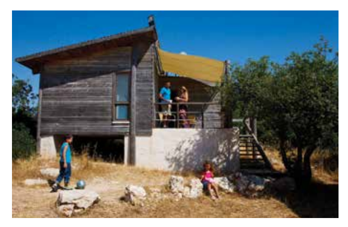
↑ Cabins at the Ajlun Nature Reserve.

Azraq Wetland Reserve attractions include several natural and ancient built pools, a seasonally flooded marshland, and a large mudflat. This is the perfect place to see incredible birds migrating from Asia and Africa.