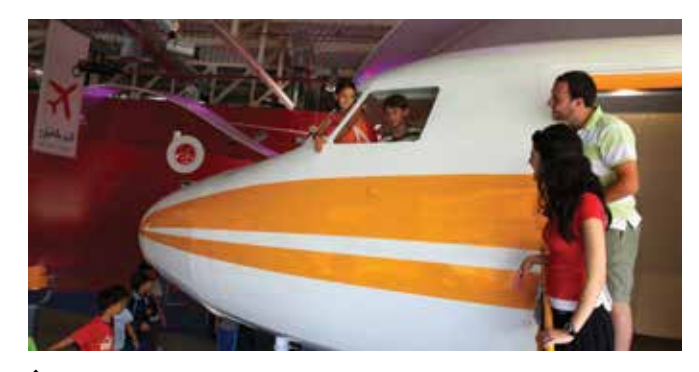
↑ The Children's Museum.

Designed for children aged 14 and under, the facilities provided by the museum include an exhibit hall, a multipurpose hall, a children's library and IT centre, an activity room, an outdoor exhibit area, an outdoor theatre, a museum shop, a birthday room, a cafe and a planetarium - a must see for all visitors coming to Jordan with their families.