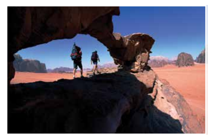
↑ Rock bridge in Wadi Rum.