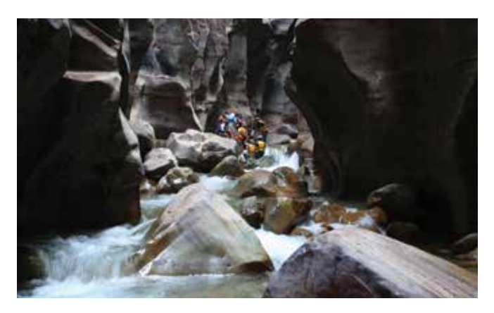
↑ The Wadi Mujib gorge.