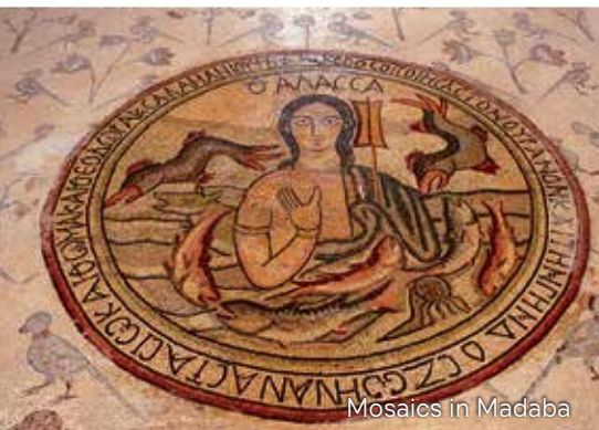
Mosaics in Madaba