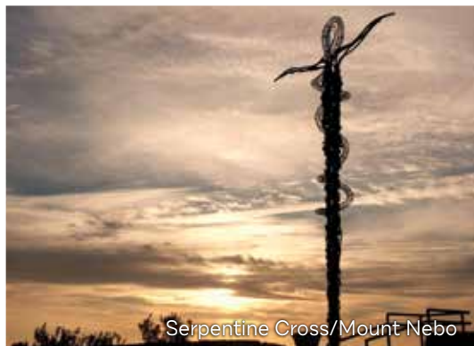
Serpentine Cross/Mount Nebo