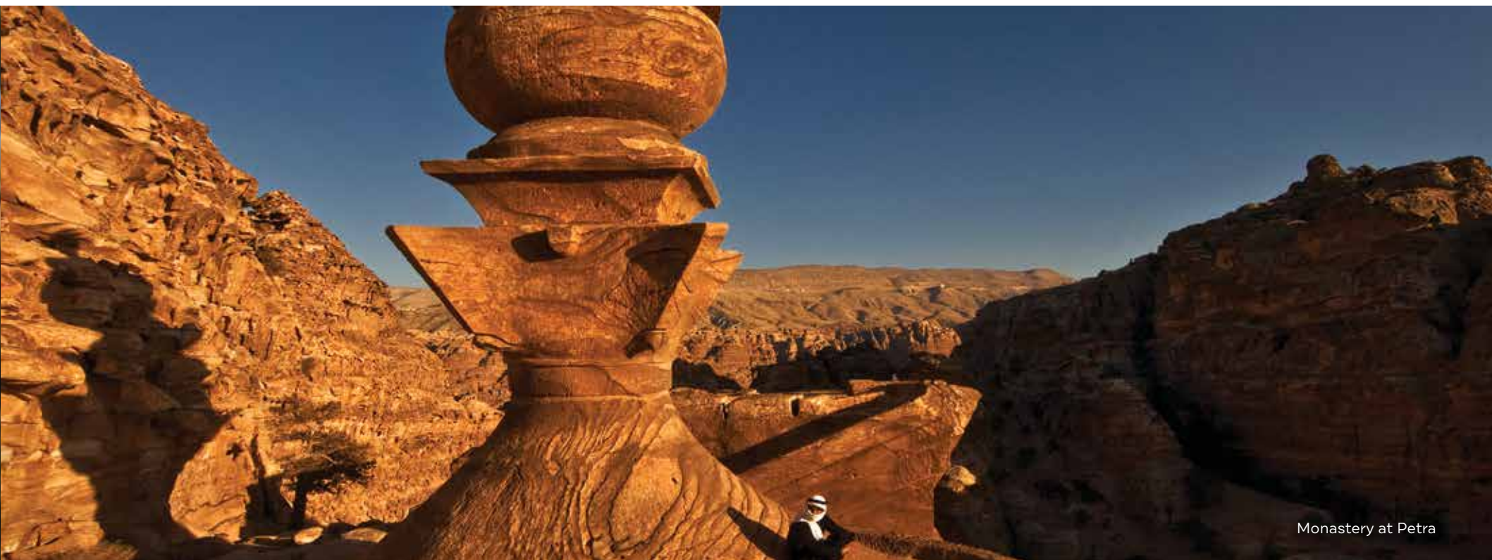
Monastery at Petra