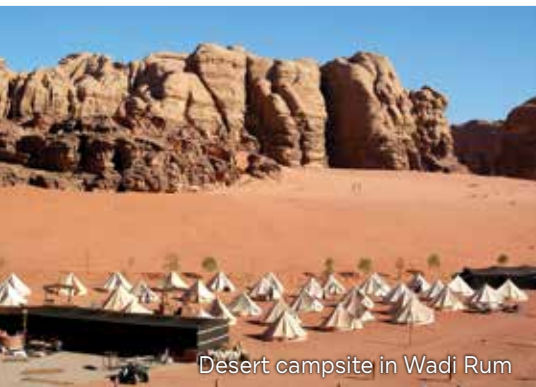
Desert campsite in Wadi Rum