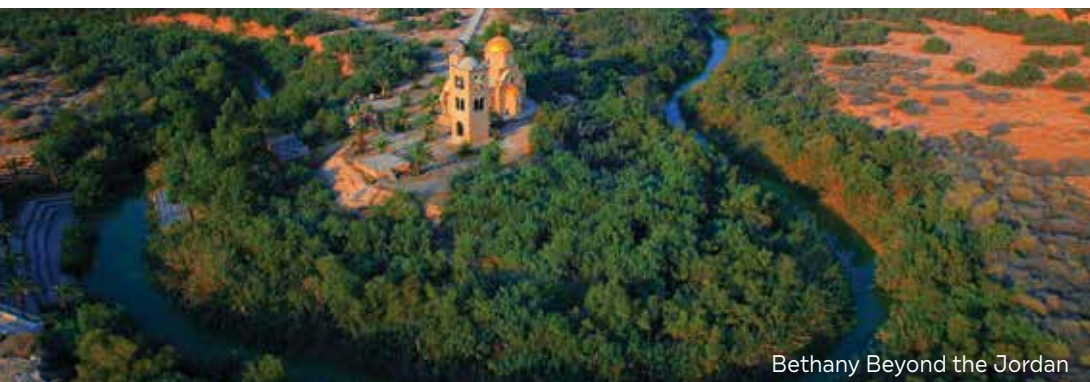
Bethany Beyond the Jordan