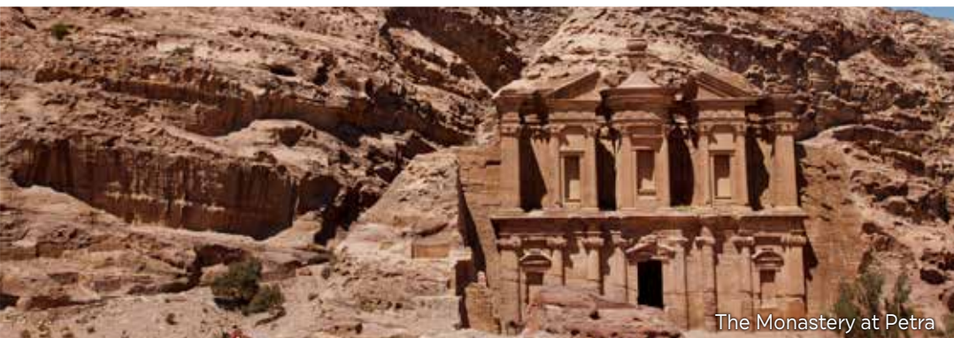
The Monastery at Petra