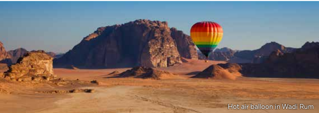
Hot air balloon in Wadi Rum