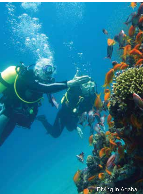
Diving in Aqaba