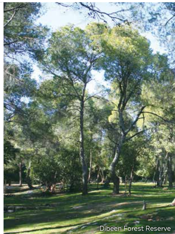
Dibeen Forest Reserve