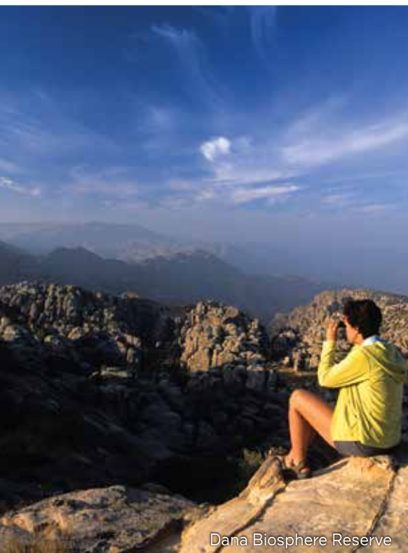
Dana Biosphere Reserve