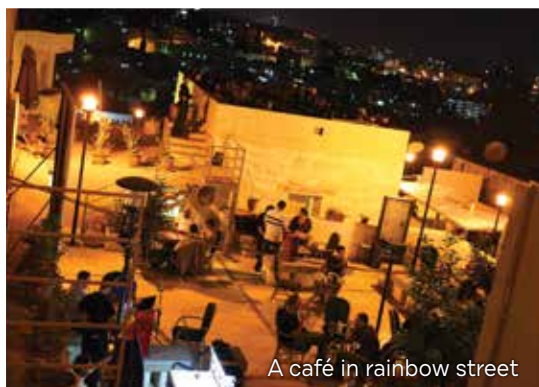
A café in rainbow street