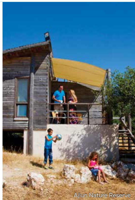
Ajlun Nature Reserve