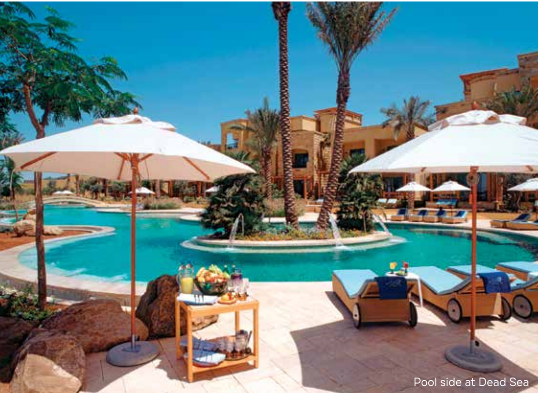
Pool side at Dead Sea