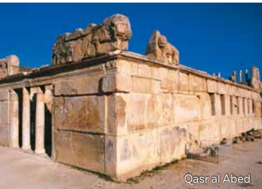
Qasr al Abed

Umm Al-Jimal , dubbed "Black Gem of the Desert," was once a town on the margins of the Decapolis League.