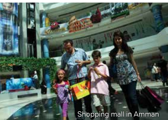
Shopping mall in Amman