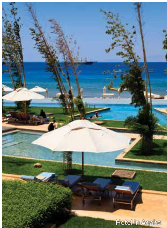
Hotel in Aqaba