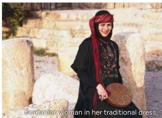
Jordanian woman in her traditional dress