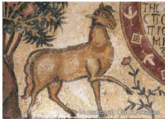
Mosaics at Um Ar-Rasas