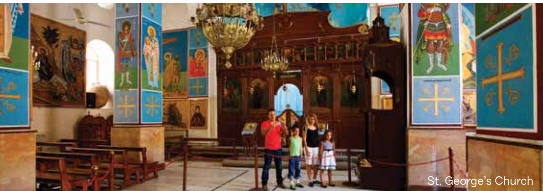
St. George's Church