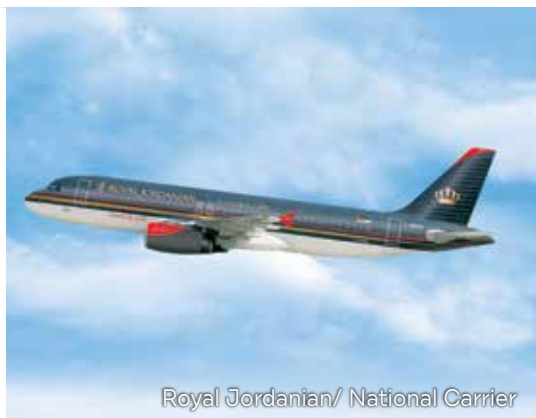
Royal Jordanian/ National Carrier