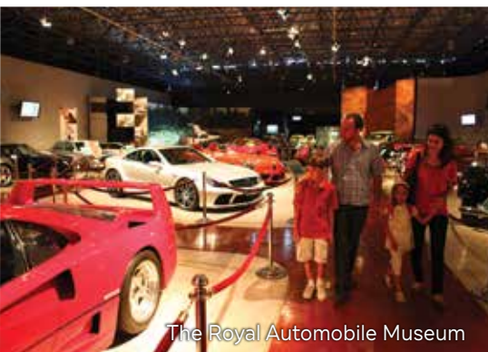
The Royal Automobile Museum