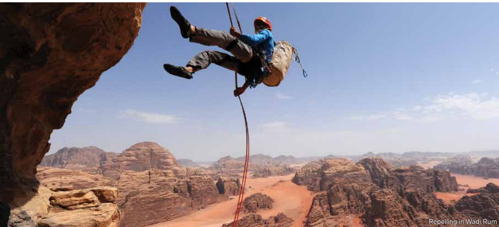
Repelling in Wadi Rum