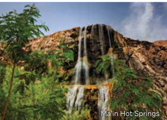
Ma'in Hot Springs