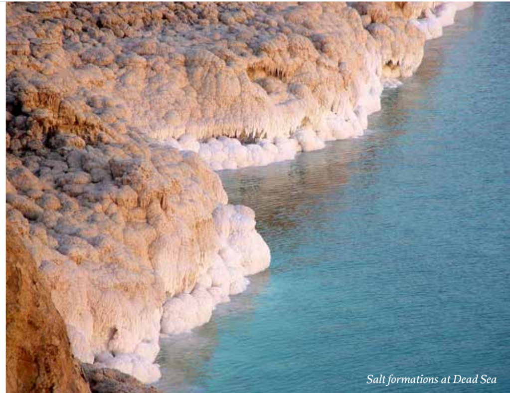
Salt formations at Dead Sea