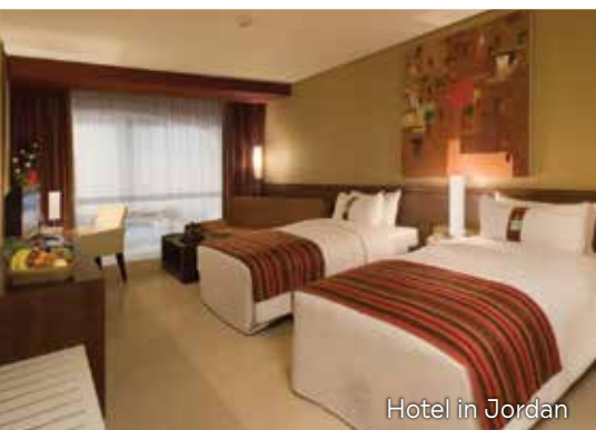
Hotel in Jordan