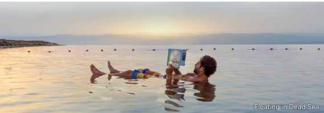
Floating in Dead Sea