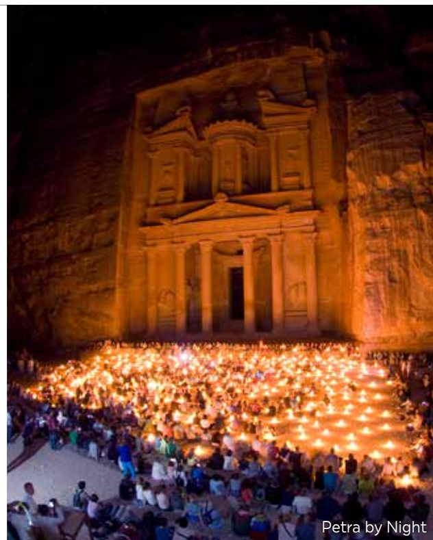
Petra by Night