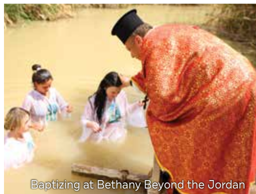
Baptizing at Bethany Beyond the Jordan